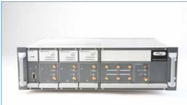
RIU-IM | Figure 1