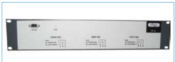
RIU-Lite | Figure 2