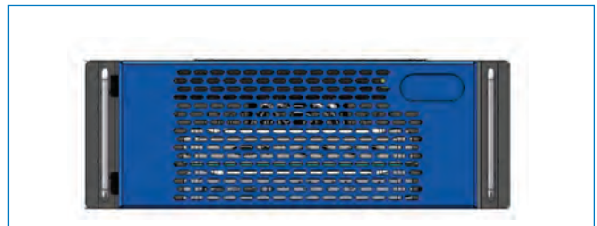
MA2000 TSX | Figure 2