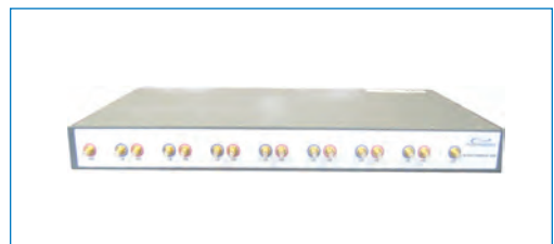
8-Port Service Combiner Unit (SCU-8) | Figure 7

Physical Characteristics • Dimensions (H x W x D): mm (in) 44 x 433 x 270 (1.7 x 17 x 10.6) • Weight: kg (lbs) 3 (6.6) • Mounting: Comes with brackets that allow it to be mounted on 19-in rack, as well as on the wall