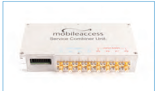
4-Port Service Combiner Unit (SCU-4) | Figure 6

Physical Characteristics • Dimensions (H x W x D): mm (in) 35 x 166 x 80 (1.38 x 6.5 x 3.15) • Mounting: Comes with bracket that allows it to be mounted directly on top of a MA2000 TSX; Optionally, can be mounted on to a TSX AMU bracket. * If being mounted to QSX, an additional bracket must be ordered.