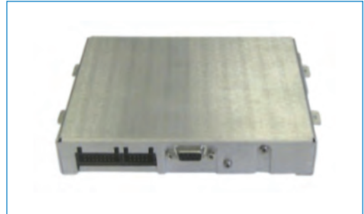
Antenna Monitoring Unit (AMU) | Figure 5

Physical Characteristics • Dimensions (H x W x D): mm (in) 160 x 260 x 127 (6.3 x 10.2 x 5) • Weight: kg (lbs) 0.3 (0.7) • Mounting: Comes with mounting holes; separate brackets need be ordered to mount on MA2000 TSX/QSX