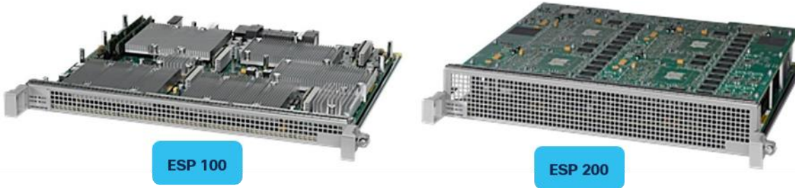
Figure 1. Cisco ASR 1000 Series ESP 100 and ESP 200