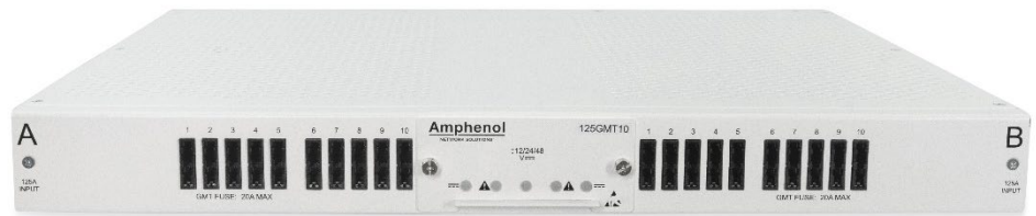
Fig. 1: 125GMT10 Front View

The Amphenol Network Solutions 125GMT10/nrg125GMT10 and 125GMT15/nrg125GMT15 fuse panels are 125A dual-feed and provide 10/10 and 15/15 GMT fuse positions. Our 125GMT/nrg125GMT panels feature \pm 12/\pm 24/\pm 48V operating voltages to serve both legacy and “next-gen” network applications. Engineered into a standard 1RU footprint that support up to 20A GMT fuses in each position, providing ample capacity for distribution to a broad range of components. The panel is available in standard terminal block outputs or connectorized outputs.