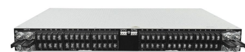
Fig. 2: 125GMT15 Rear View

This platform provides front access to GMT fuses. Also featured are front LED indicators for power/fuse alarms, monitoring status, rear connections for form C relay alarms, and optional nrgSMART connections.