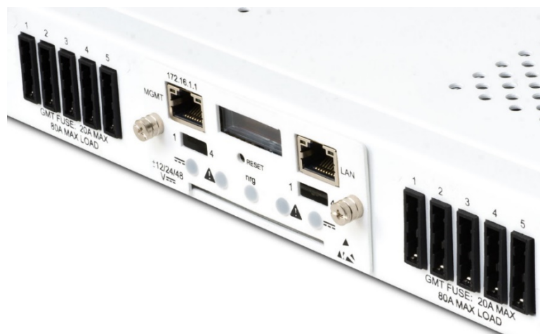
Fig. 4: 125GMT10-CTRL