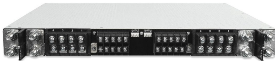
Fig. 2: 240GT54 Rear View

This platform provides front access to alarm enable/disable switch configuration for uninstalled TPA fuse or breaker locations. Also featured are front LED indicators for power/fuse alarms, monitoring status, rear connections for form C relay alarms, and optional nrgSMART connections.