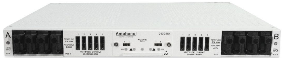
Fig. 1: nrg240GT54-SENS Front View

The Amphenol Network Solutions 240GT54/nrg240GT54 combination fuse panels are 240A dual-feed and provide 5/5 GMT fuse positions and 4/4 TPA fuse or circuit breaker positions. Our 240GT54/nrg240GT54 panels feature \pm 12/\pm 24/\pm 48V operating voltages to serve both legacy and “next-gen” network applications. Engineered into a standard 1RU footprint, with circuits that support up to 20A GMT fuses and 50A TPA fuses or 60A breakers in each position, providing ample capacity for distribution to a broad range of components. The panel is available in standard terminal block outputs or connectorized outputs.