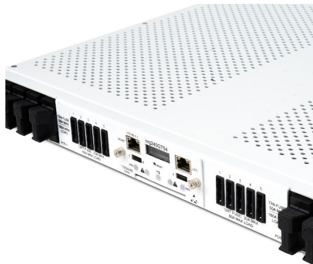
Fig. 4: nrg240GT54-CTRL Front View