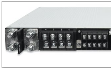
Stud Input/Lug Output