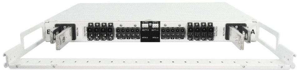
Fig. 3: 240GT54-C Rear View