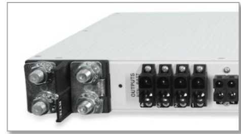
Connectorized/Stud Input "-SC"