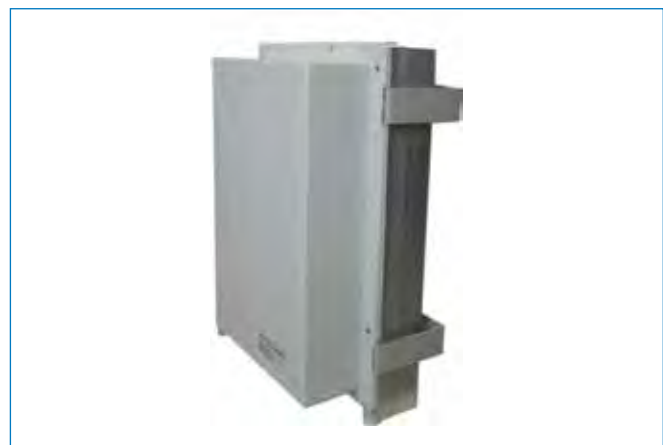
Remote-end: Outdoor | Figure 4