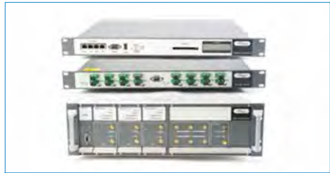
Headend: System Controller, Base Unit, RIU | Figure 2

The MobileAccessHX Remote Unit (indoor-SISO/MIMO and outdoor-SISO models) consists of a compact enclosure housing the RF module, power elements and required interfaces. The RF module supports three bands (GSM, DCS and UMTS) and two types of quad bands (Type 1: LTE700, CELL, PCS and AWS or Type 2: CELL, EGSM, DCS and UMTS). All mobile services are combined and distributed through a single antenna port over antennas installed at the remote locations.