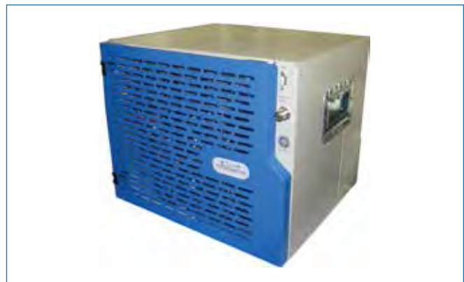
Remote-end Indoor Units: SISO/MIMO | Figure 3