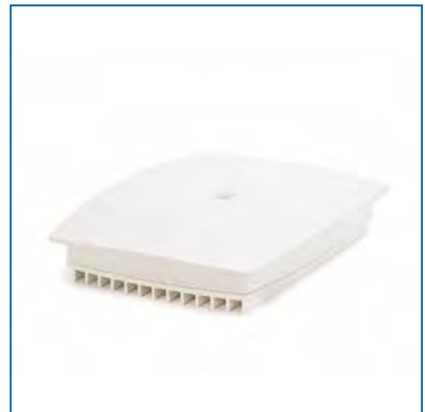
SCRN-310 | Figure 1

As the demand for mobile broadband accelerates, mobile network operators need to efficiently utilize both UMTS and LTE technologies, without creating new network complexity. The SpiderCloud® scalable small-cell system, called an enterprise radio access network (E-RAN), hides the complexity of radio management and mobility and provides operators with a single touchpoint to aggregate and manage a large network of UMTS, LTE, and multiaccess (UMTS and LTE) small cells.